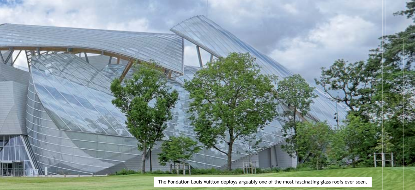
The Fondation Louis Vuitton deploys arguably one of the most fascinating glass roofs ever seen.

Initial development work centred around the feasibility of actually constructing the 12 unique sails coupled with investigations into the physical formulation and appearance of the glass panels, all of which had to offer long-term durability for what is a project that relies a great deal on its striking aesthetics. Many factors were considered in the glass formulation, including the transparency/translucency, the colour, the coating and of course the all-important interlayer. Given the complexity of the sails and their multiple facets, all of which required unique geometries, glazing panels made using SentryGlas® were the obvious solution.