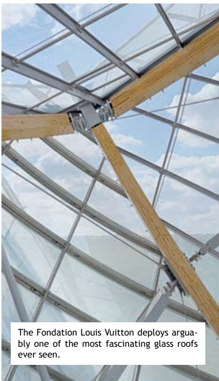
The Fondation Louis Vuitton deploys arguably one of the most fascinating glass roofs ever seen.

SentryGlas® ionoplast interlayer and Dow Silicone has played a critical role in one of Europe's most striking architectural constructions. The Fondation Louis Vuitton, situated in the Jardin d'Acclimatation on the northern edge of the Bois de Boulogne in Paris, deploys arguably one of the most fascinating glass roofs ever seen, with 12 unique, curved glass sails emerging above the treeline like a sailboat.