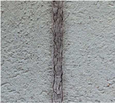
Failed urethane sealant in EIFS joint