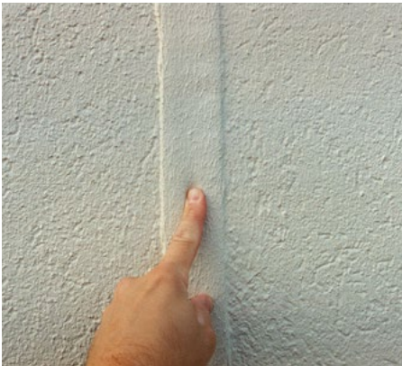
EIFS joint restored using DOWSIL™ 123 Silicone Seal

In EIFS applications, there's no need to cut out the old seals – a costly, labor-intensive step that can damage soft EIFS cladding. When DOWSIL™ 123 Silicone Seal is properly bonded over any failed joint, you not only stop leaks, but you also save time by eliminating the sealant removal step.