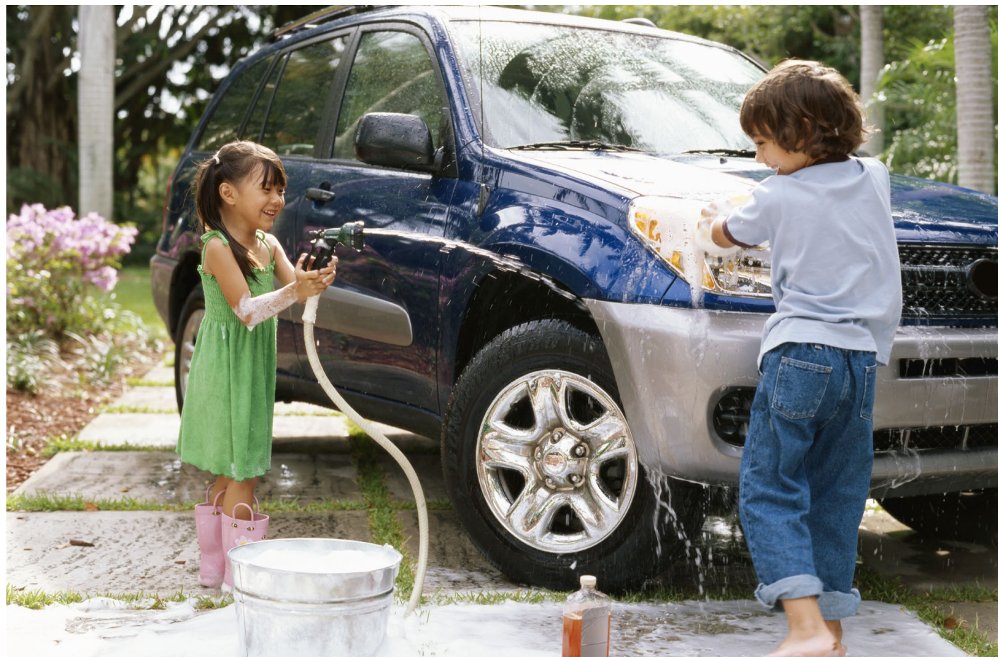
Dow Oxygenated Solvents offer a range of solvency, water solubilities and volatilities that present a wide variety of formulating opportunities for the producers of household and industrial/institutional cleaners.