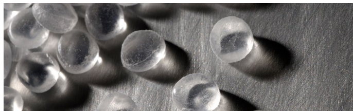
NORDEL™ EPDM offers exceptional polymer cleanliness.

Dow's NORDEL™ ethylene propylene diene terpolymers (EPDM) product family features one of the widest range of ethylene content available in the industry. These high-quality, virtually gel-free polymers enable improved yields, reduced scrap rates, and unparalleled polymer cleanliness. NORDEL™ EPDM is made using Dow's proprietary advanced molecular catalyst (AMC) technology in a solution process, and is sold both as bales and as free-flowing pellets.