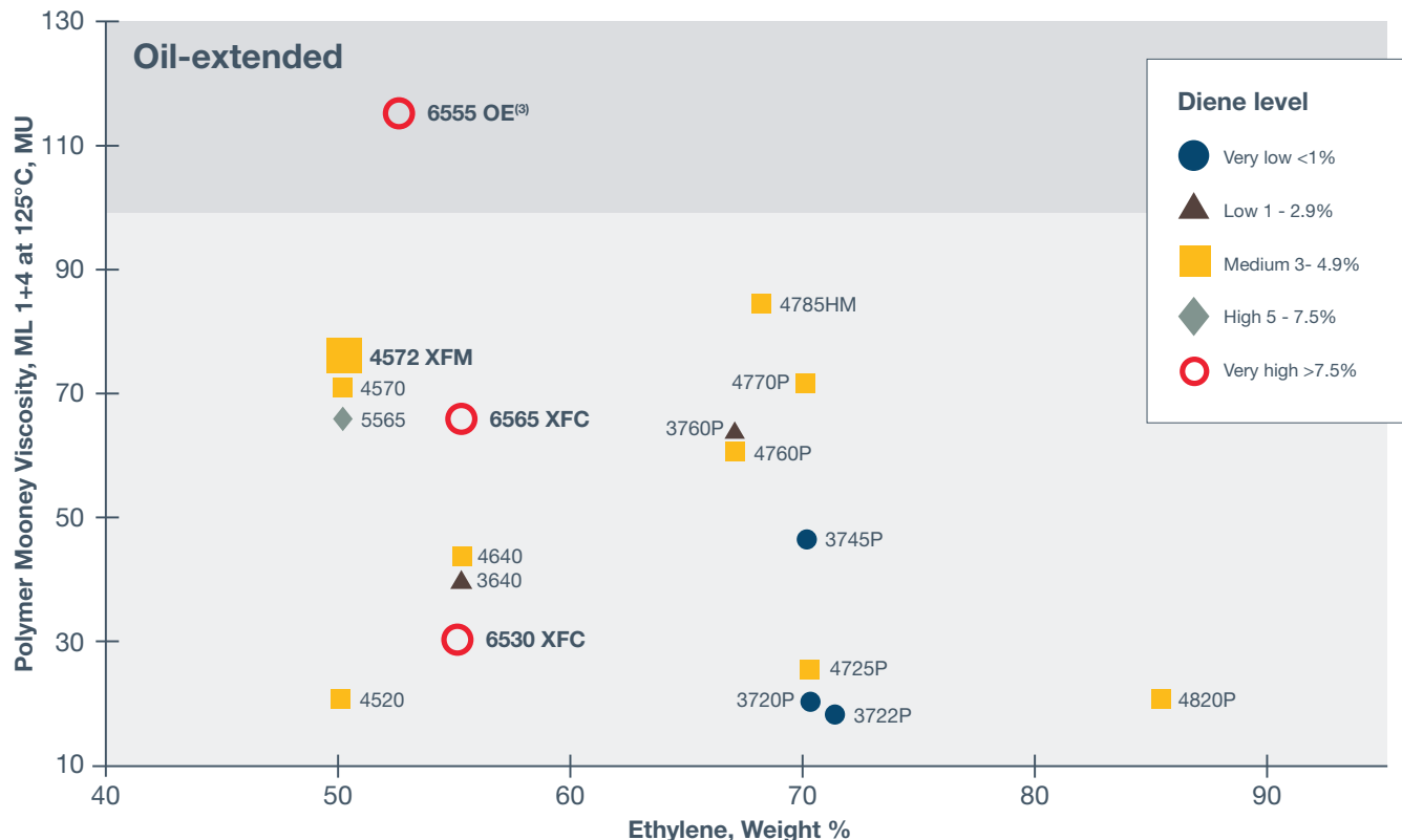
Figure 1: Property ranges of NORDEL™ EPDM products (1,2)