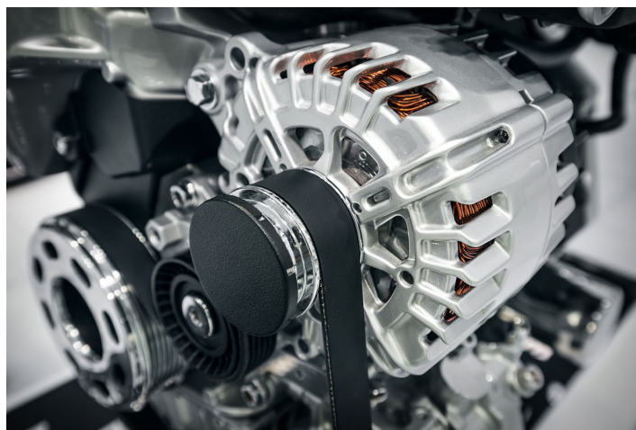
High-heat products for automotive belts.