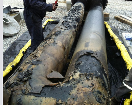
Before: Scale buildup and corrosion from commodity TEG.

Increased chloride levels in the glycol indicates more salt is held in the system versus deposited, reducing the likelihood of buildup, corrosion and unnecessary downtime.