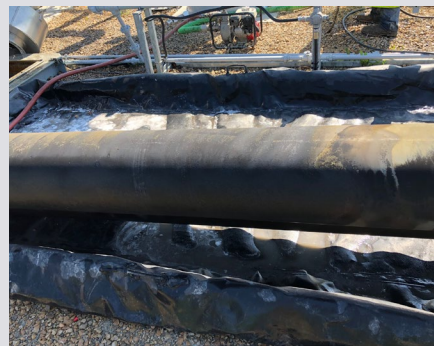
After: Equipment after operating with NORKOOL DESITHERM™ HS for roughly 15 months.