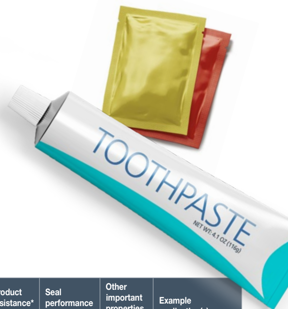
Table 1: Ethylene Methacrylic Acid Resins

NUCREL™ Acid Copolymers also have uses in a variety of non-packaging applications, where the benefits are similar to those found in packaging. Key markets on the industrial side include wire and cable, including adhesives for foil in cable jackets; as an adhesive surface in thermal lamination films for bonding to metals and fabrics, for example automotive headliners; and as an adhesive layer between SURLYN™ Ionomers and polyethylene in shock tubes in explosive detonator systems.