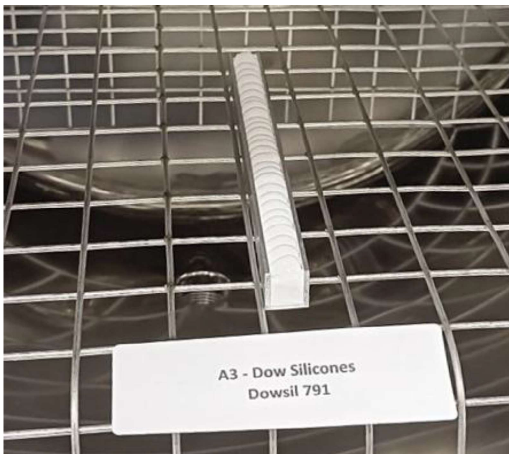
Figure 1: Photograph of sample in test chamber.