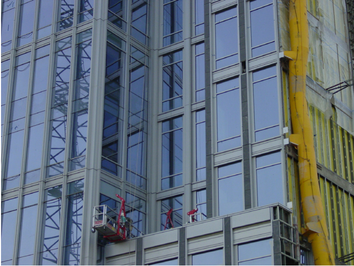
When completed, the new Pier 1 Center will employ approximately 94,440 linear feet of DOWSIL™ 756 SMS Building Sealant in joints between glass, stone and aluminum substrates.

To meet these requirements, Haley Greer selected DOWSIL™ 756 SMS Building Sealant, a one-part silicone material specifically developed to avoid residue build-up and staining of glass and sensitive porous building materials. When fully cured, the medium-modulus formulation delivers excellent adhesion to glass, brick and other common substrates, and can accommodate 50% movement in a properly designed joint.