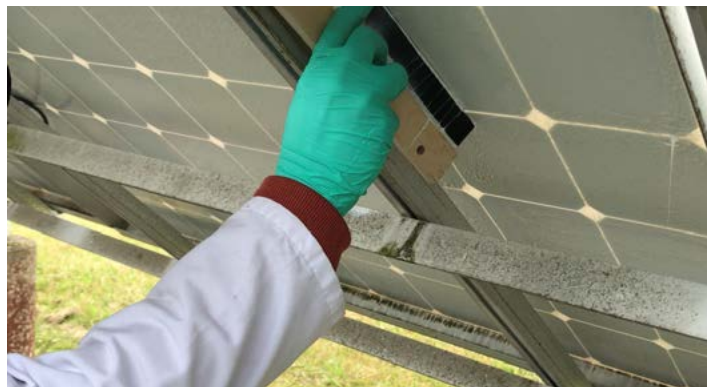
Smoothing the layer