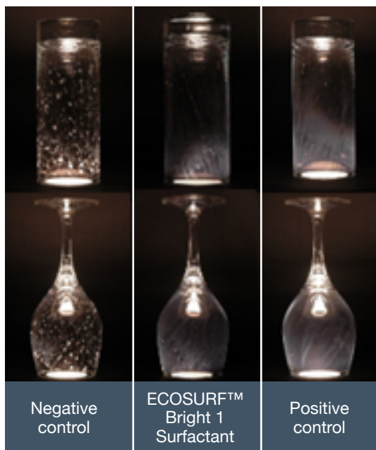
Citrate base 5 wt.% surfactant, after 5 cycles