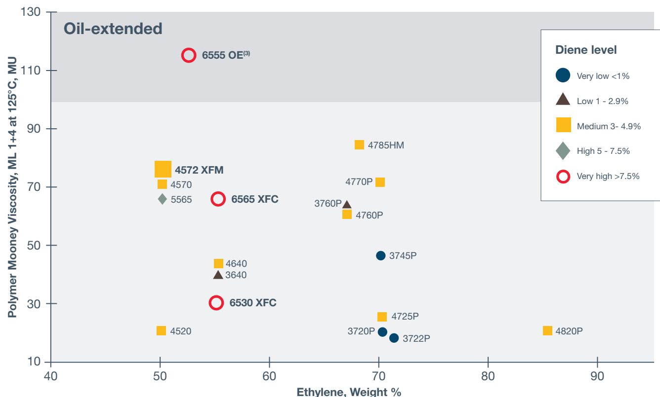
Figure 1: Property ranges of NORDEL™ EPDM products (1,2)

NORDEL™ EPDM offers exceptional polymer cleanliness.