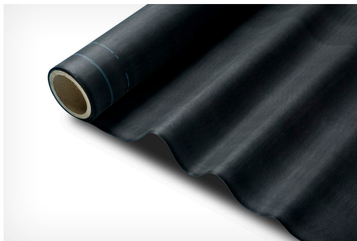
Protective compounds for roofing membranes.