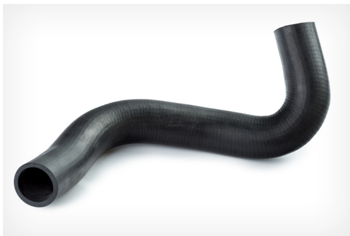
High-heat products for automotive hoses.

(4) Compliant as a blend component in compliant polymers at levels up to 25% for conditions of use E through G.