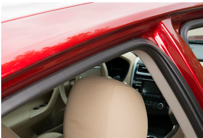
Durable products for weatherstripping, seals, and gaskets.