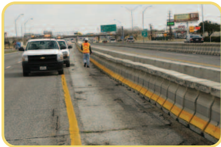
Finished project: 1.1 miles of 6 inch yellow paint stripe on HOV barrier wall on I-30 in Dallas, TX.

brightness of the marking. It really stands out, especially in the rain,” states Jason Mashell of TX DOT. Other states are also looking to this system of waterborne paint and high index glass beads to improve the visibility of their barriers. This system is ideally suited for those who are charged with keeping drivers safe at an affordable price.